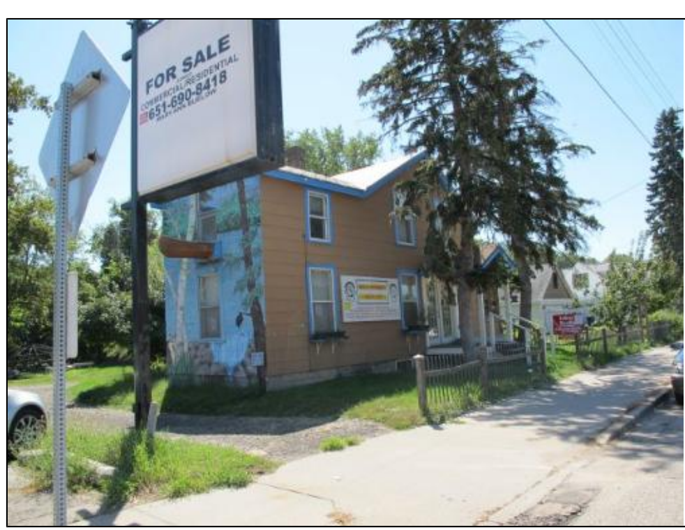
Nicole Norfleet, Star Tribune

While the sale hasn't been finalized, the Mendota Dakota recently received a 60-day n otice to vacate the building at